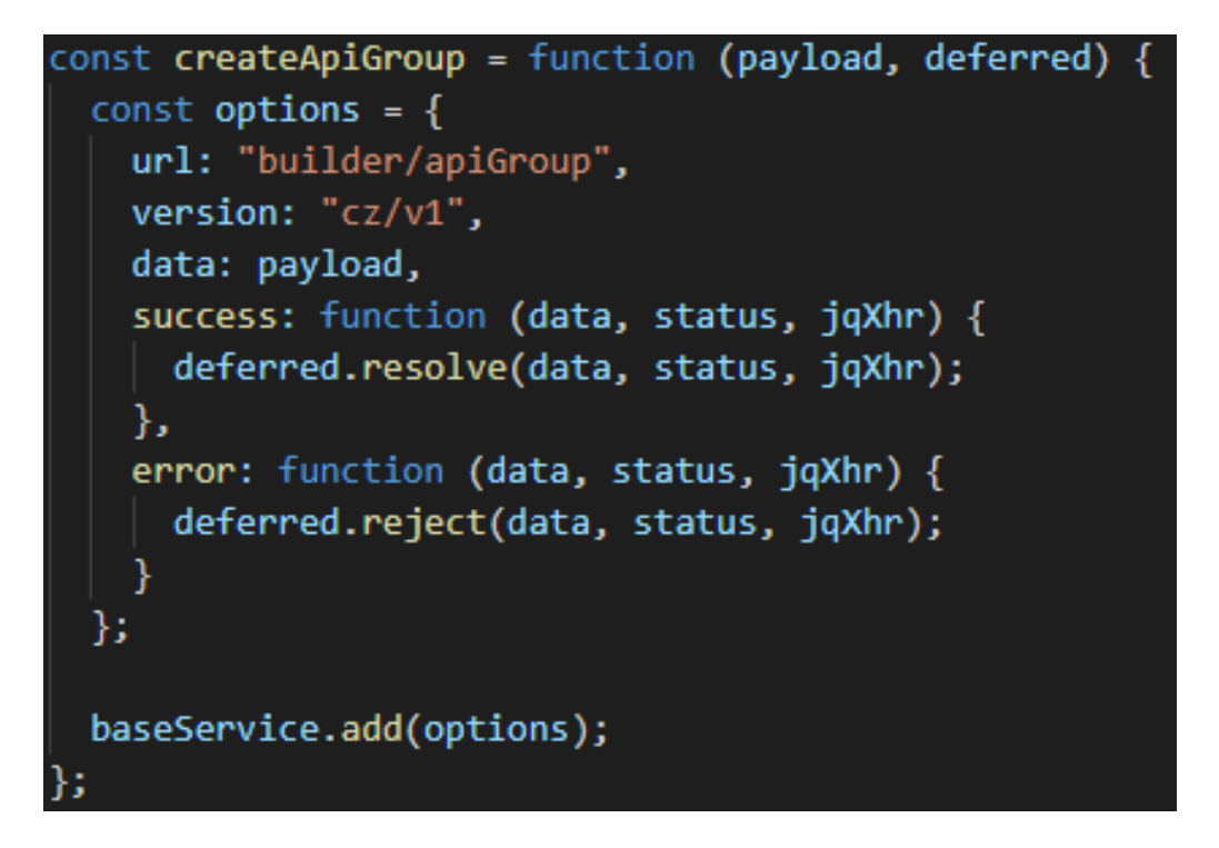
Figure 2 : Sample calling Custom REST Services